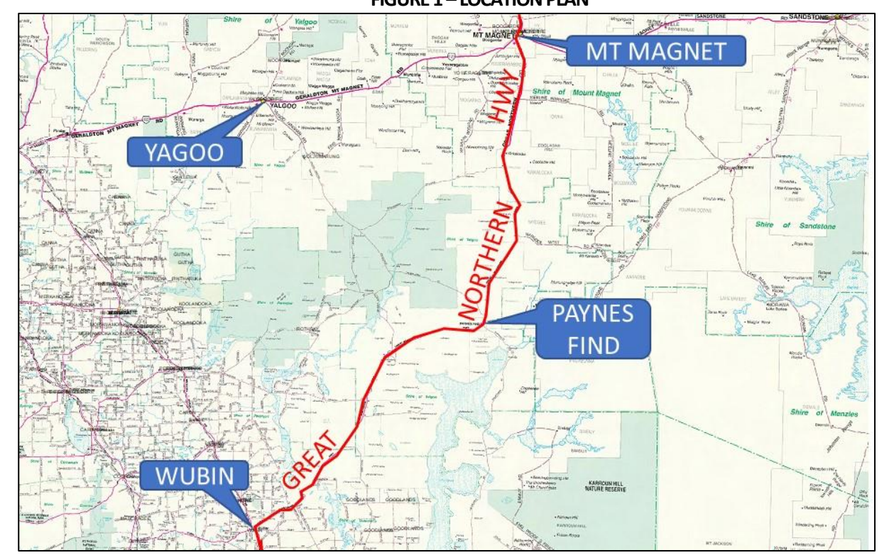
FIGURE 1 - LOCATION PLAN

The roadhouse is located 423 kilometres from Perth, 155 from Yalgoo, 153 from Wubin and 143 from Mt Magnet. Figure 1 shows the location in respect to the wider region.